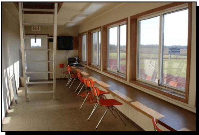
Interior of Press Box showing media work area, and stairs up to camera deck on roof.