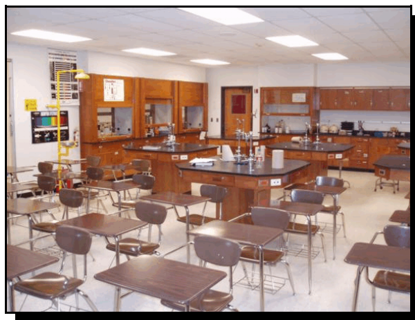
New Science Laboratory