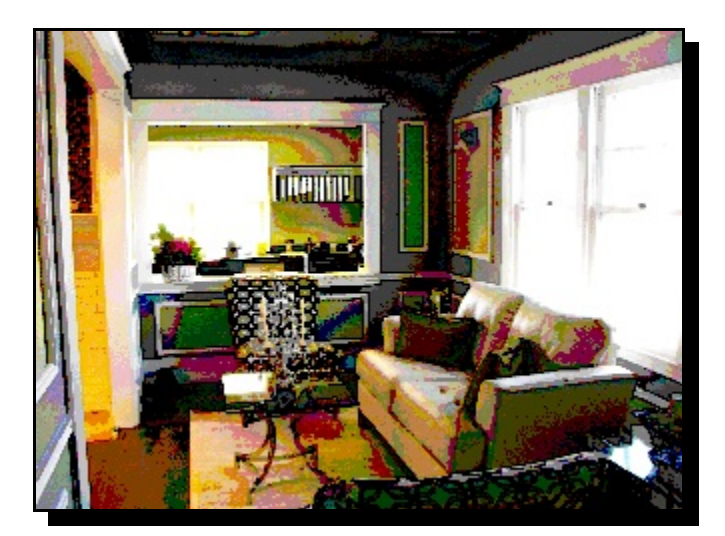
New Reception and Waiting area