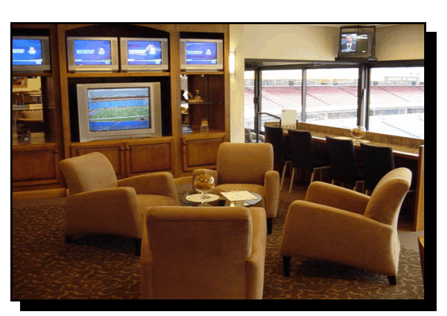
Bills Marketing Dept. Mega-Suite